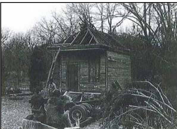
Moving day for medical office.