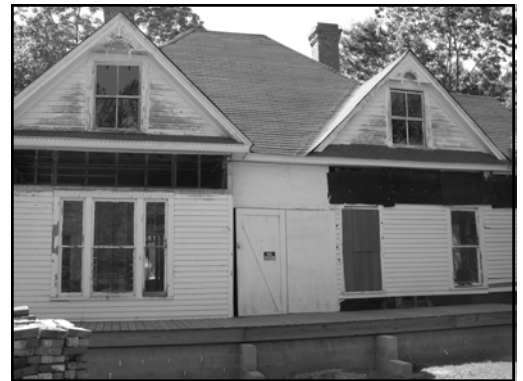
Duncan/Strickland Home prior to renovation