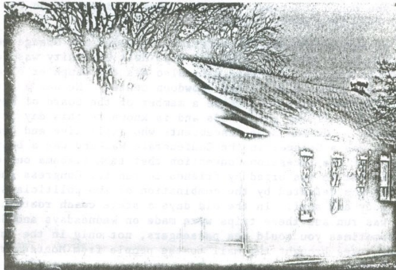
SNOWDOWN METHODIST CHURCH, Circa 1950